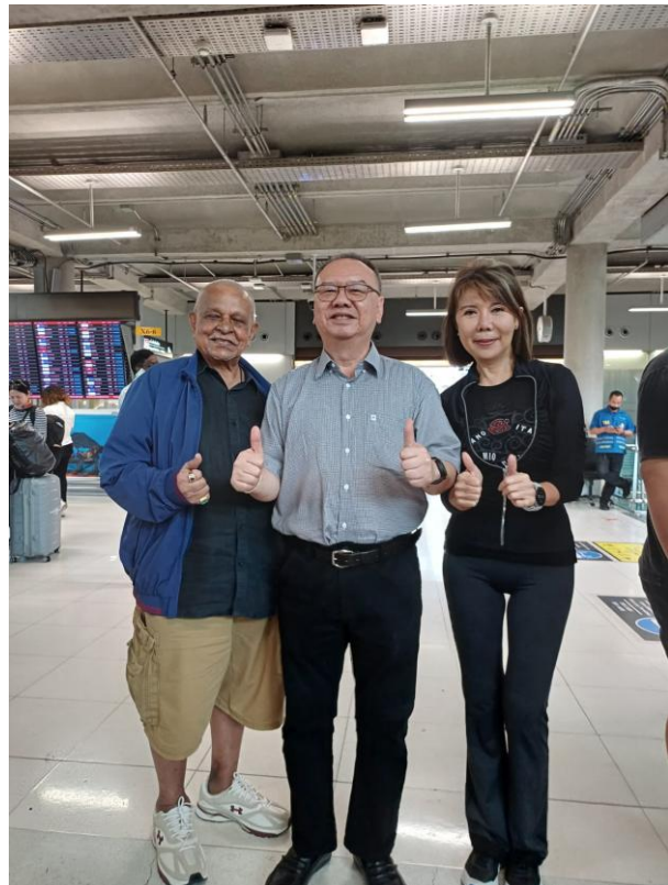
At the Suvarnabhumi Airport...