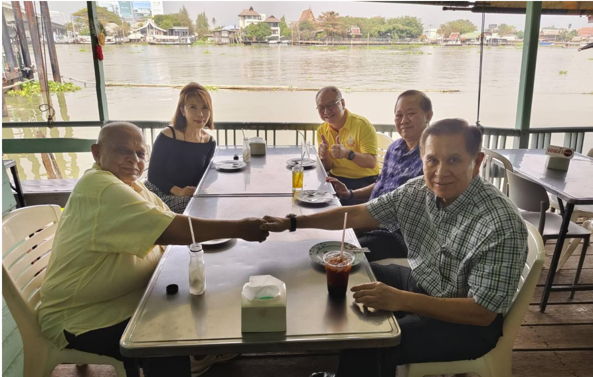
Lunch with General Thanasak Patimaprakorn the former Deputy Prime Minister and Minister of Foreign Affairs of Thailand at the Hong Seng Seafood restaurant, a Michelin starred eatery next to the Chao Phraya River...